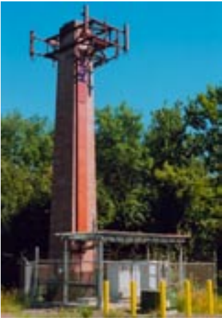
Cellular antennas mounted on existing smoke stack