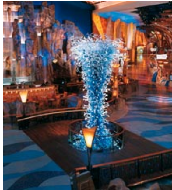
Mohegan Sun expansion, interior finish