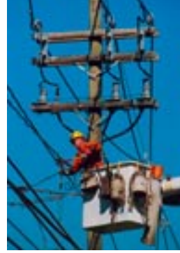
Overhead utility tie in