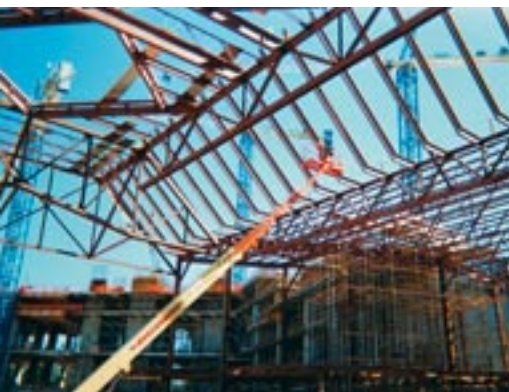
Mohegan Sun expansion