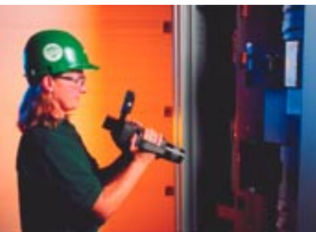
Infrared Thermography of electrical switchgear

An electrical emergency or crisis can put your entire operation at risk. On call 24/7 and specifically trained and equipped for these situations, McPhee knows how to intervene and rescue your facility from the potential loss an electrical failure or malfunction can cause.