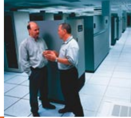
Data center in operation